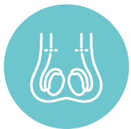
Vasectomy (male sterilisation)