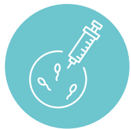
Special Fertility Services including: - Intra-uterine insemination (IUI) - In vitro fertilisation (IVF), with or without intra-cytoplasmic sperm injection (ICSI) - Sperm and egg donation (sperm and oocyte donation)

This document describes our proposals for updating the policies, to help bring them into a new single policy for each of the six service areas, and gives you the opportunity to tell us what you think about them.